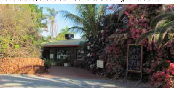
Day 6 Kalbarri – Carnarvon (B/L/D)

On the road again through Historic Northampton and Horrocks beach to discover more wildflowers and the history of the Lynton Convict Depot. Take the opportunity for a photo of the Pink Lakes at Port Gregory. In Kalbarri take a walk on the wild side, where you will find the largest parrot free flight aviary in the country, with the largest flock of Purple Crowned Lorikeets in the world and many other magnificently coloured Australian parrots. Wander through landscaped tropical gardens, past waterfalls, fountains, stained glass windows, gargoyles and lily ponds. You will enjoy close encounters with the magnificent Australian Black Cockatoos - the red, the yellow and the local white tails. Around every corner there are parrots in every colour of the rainbow, including the beautiful Eclectus parrot and the fantastic, exotic Sun Conure. Overnight Kalbarri.