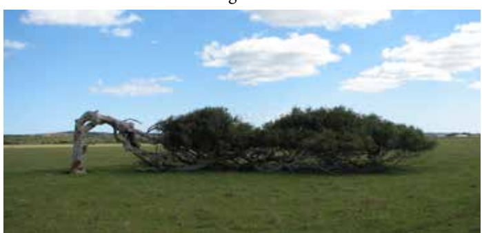
Day 9 Geraldton - Cervantes (B/L/D)

Discover more wildflowers as we backtrack via Historic Chapman Valley where the discovery in 1848 of a rich lode of galena (lead ore) in the bed of the lower Murchison River sparked development of the Northampton Mineral Field and the establishment of Geraldton as a garrison and later a port. The first lead mine in Australia, the 'Geraldine Mine', opened in 1849. The Fremantle-Champion Bay Mining Company mined the field from 1870 to 1885, when falling prices made it uneconomical. Take a night tour of the HMAS Lookout. Overnight in Geraldton