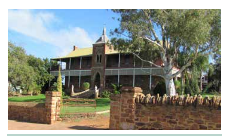
Day 8 Carnaryon – Geraldton (B/L/D)

Discover more wildflowers as we backtrack via Historic Chapman Valley where the discovery in 1848 of a rich lode of galena (lead ore) in the bed of the lower Murchison River sparked development of the Northampton Mineral Field and the establishment of Geraldton as a garrison and later a port. The first lead mine in Australia, the 'Geraldine Mine', opened in 1849. The Fremantle-Champion Bay Mining Company mined the field from 1870 to 1885, when falling prices made it uneconomical. Take a night tour of the HMAS Lookout. Overnight in Geraldton